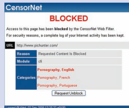
Access to webpages containing unsuitable material can be blocked and Internet Activity is logged.