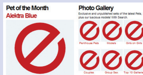
Image Filter stops unsuitable images being displayed